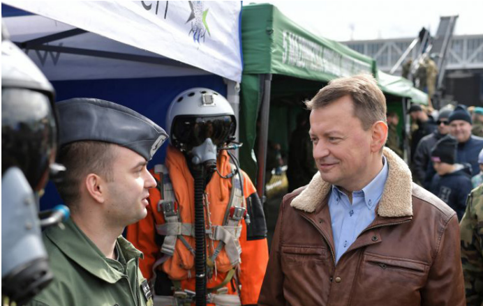
Polish Defense Minister Mariusz Błaszczak at the Air Force base in Mińska Mazowiecka.